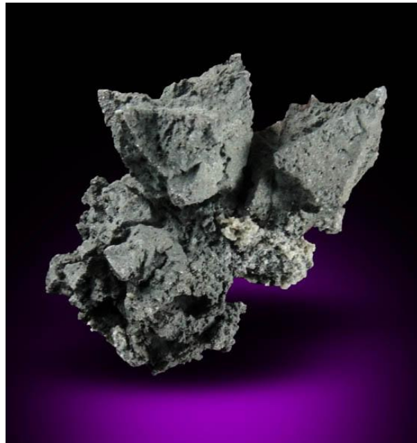
#81944, Acanthite , Mine d'Imider, Morocco Sale Price $22.50