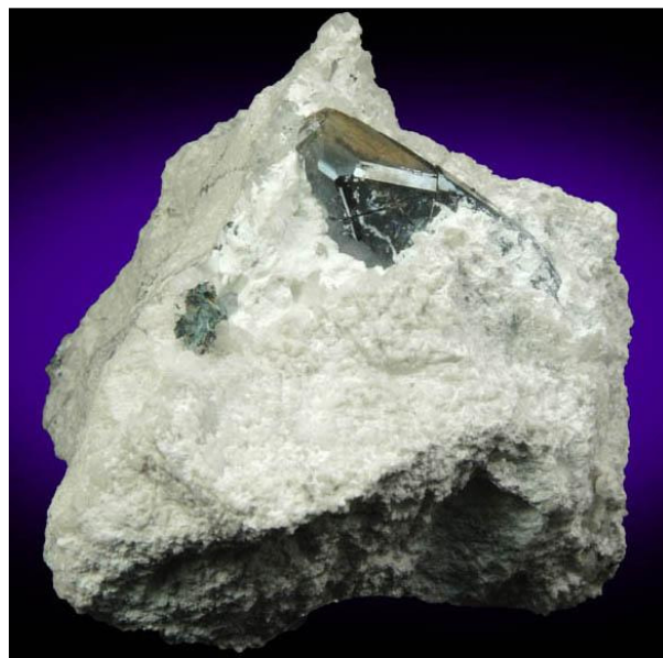
#75757, Chalcocite over Pyrite , Milpillas Mine, Mexico Sale Price $16