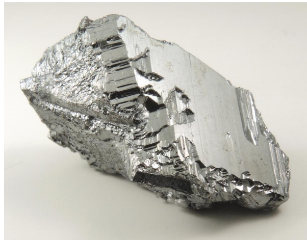
#81550, Bournonite twinned crystals , Yaogangxian Mine, China Sale Price $95