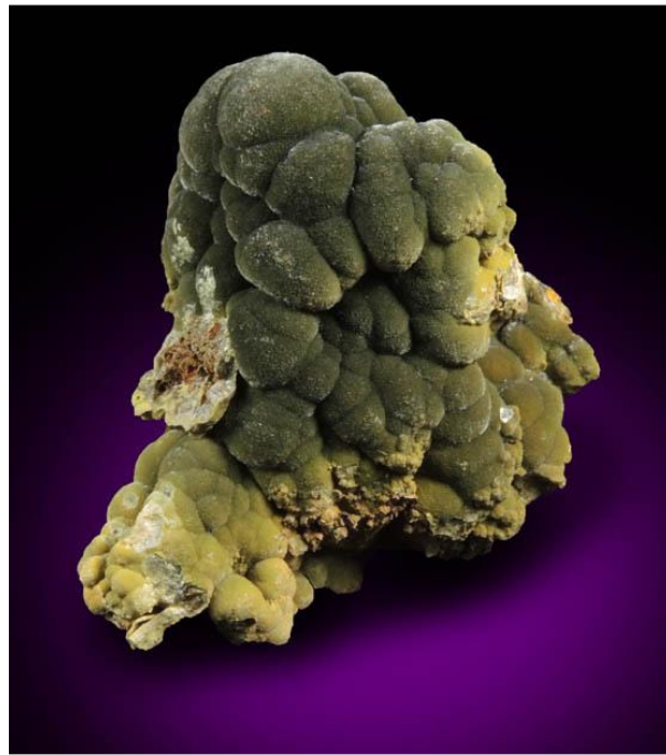
#81842, Mottramite , Mina Ojuela, Level 35, Mexico Sale Price $12.50

Minerals priced above $100 at deep discounts up to 65% off retail. See these minerals at: