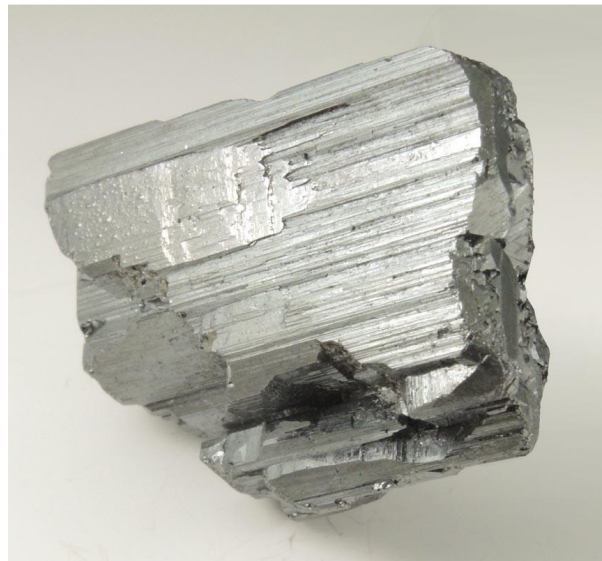
#81546, Bournonite doubly terminated twinned crystals , Yaogangxian Mine, China Sale Price $125