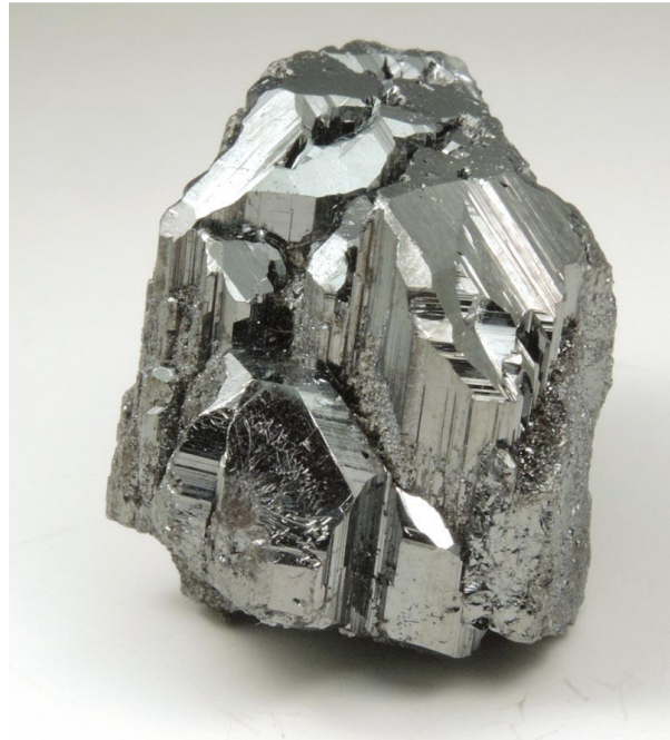
#81551, Bournonite twinned crystals , Yaogangxian Mine, China Sale Price $125