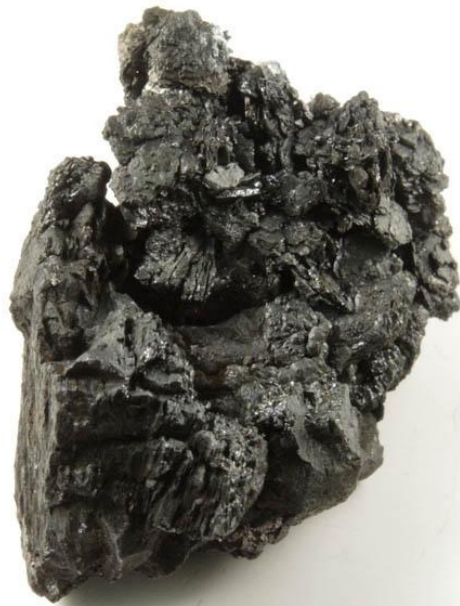
#81595, Chalcocite with Chalcopyrite-Bornite coating , Flambeau Mine, Wisconsin Sale Price $24