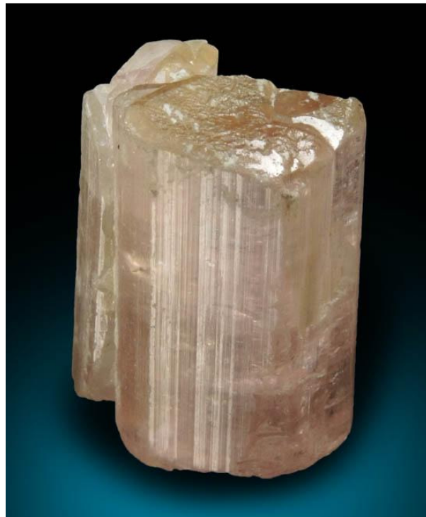
#82689, Elbaite var. Rubellite Tourmaline , Kamdesh District, Afghanistan Sale Price $20